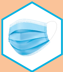
Nose Pin for Comfort