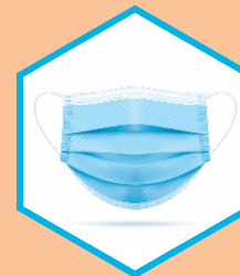
Different options of Filter Protection & Fluid Resistance