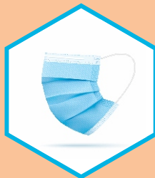
Made By Automatic Plant