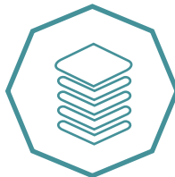
5 Layers Protection