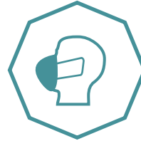
Elastic Ear Loops